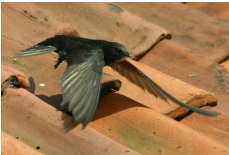
A Swift leaves its nest under pantiles near Lincoln