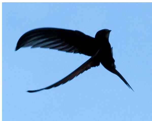
A Swift comes in to land in its nest

For a choice of designs please see http://www.swift-conservation.org/Nestboxes&Attraction.htm#D.I.Y.